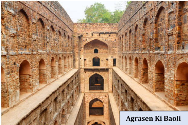
Agrasen Ki Baoli

Departure: Transfer to the airport for your flight back to your home country.