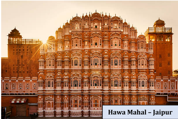
Hawa Mahal - Jaipur

Dinner & Overnight: Return to the hotel for dinner and overnight stay.