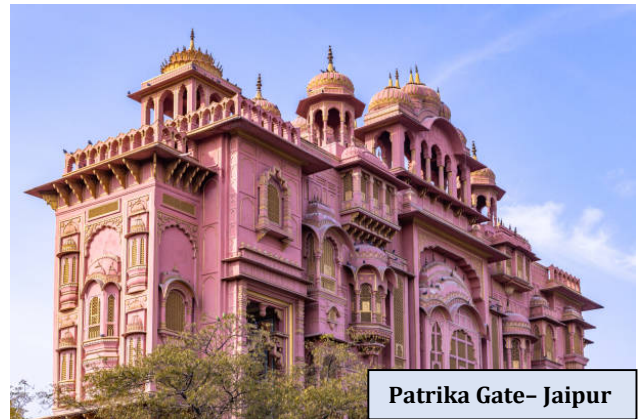
Patrika Gate- Jaipur